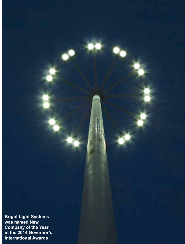
Bright Light Systems was named New Company of the Year in the 2014 Governor's International Awards

He continued: "Data management and control are performed by our Bright Light Management