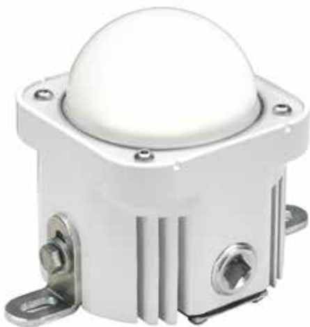
Phoenix's new LED Cube-Light product

With expectations of more new installations and retrofits of LEDs over the next few years, Fletcher is confident that Phoenix will achieve significant growth. He summarised the situation: “Every port operator analysing