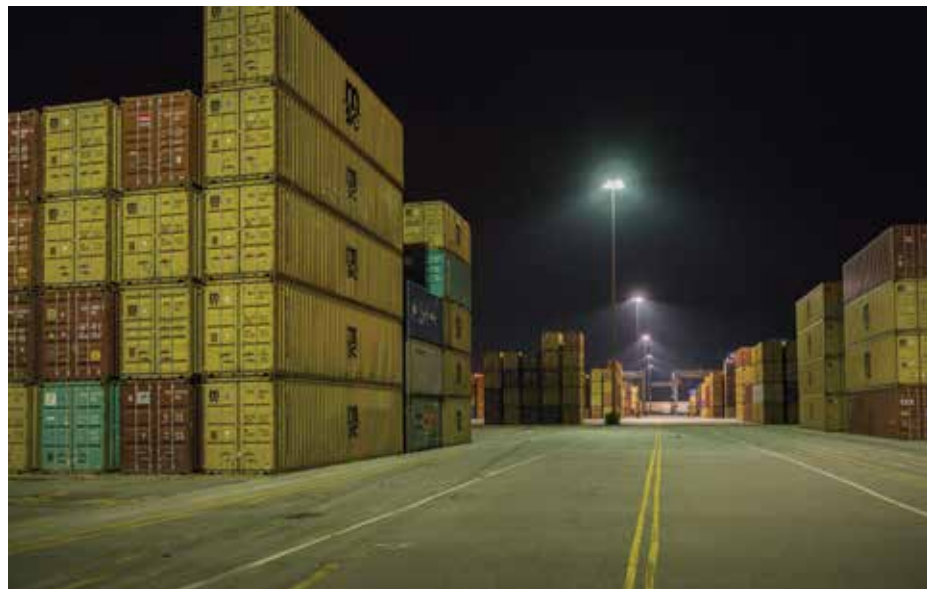
Georgia's Garden City Terminal received a customised solution from Musco

continue to spend money on high energy costs will look at our LED solution as it further reduces energy consumption, offers superior spill/glare control and better aiming logic, and eliminates long-term maintenance with our comprehensive warranty."